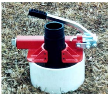
4" pipe on 12" casing