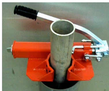
3" steel on 8" casing