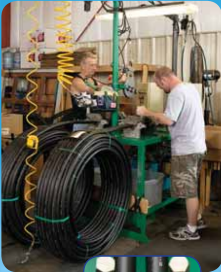
Centennial Bullet™ U-Bend fittings are fused to the Cenfuse pipe prior to shipping.