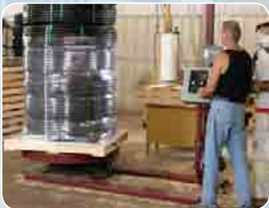
Coils are stretch-wrapped in plastic and shipped on pallets.

This certification assures engineers that the superior properties of Centennial Cenfuse pipe parallel those of pipe certified to safely transport water for human consumption. It also means that Centennial Cenfuse pipe provides ultimate protection to the environment by protecting the aquifer against contamination.